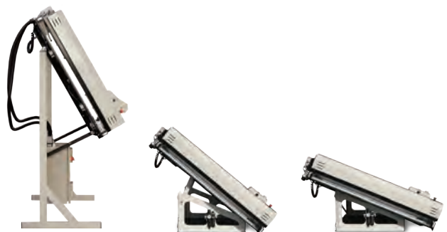
Table Top/Upright Stand

The rotating tray can be easily extended or retracted as needed for quick and easy access to any of the interchangeable tool heads.